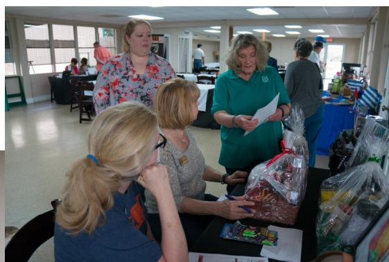
Preparing the silent auction