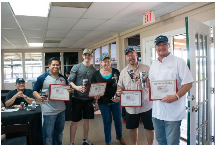
Third Place Team