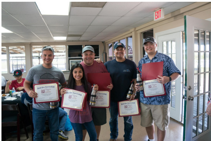
Second Place Team