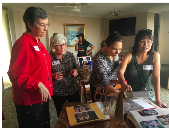
Photo albums command attention