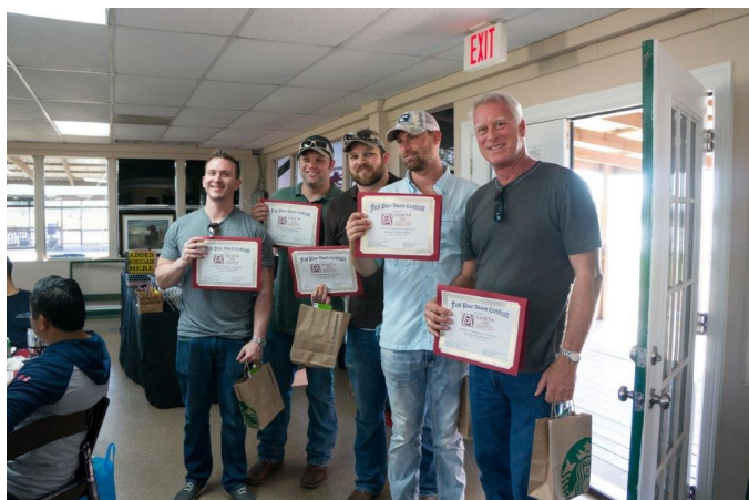
First place team members pose with their certificates