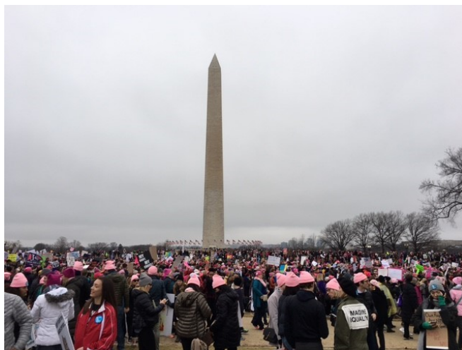
Marchers near the Washington Monument