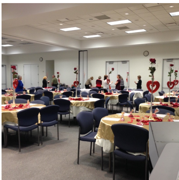
Decorating for the Awards Dinner