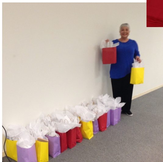
Gift bags ready to go!