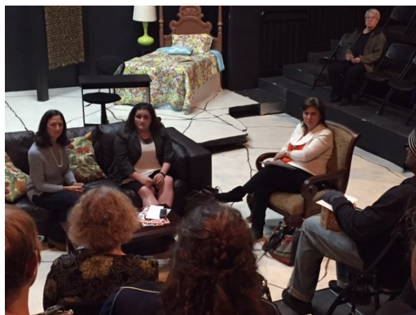
Discussion following performance of “The Johns”