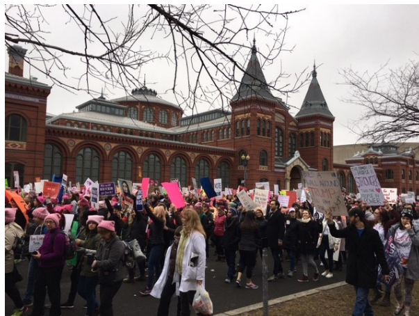
The Women's March in Washington, D.C., January 21st, 2017