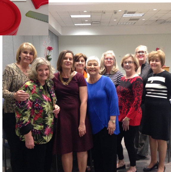
Zontians pose for a "formal" portrait