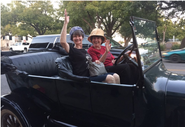
Farewell until Oklahoma City in October 2017!