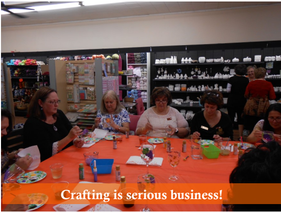
Crafting is serious business!